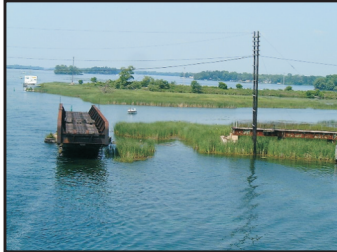
Start of Ramara Trail at the Narrows Fish Weirs

The trail starts in the south at the historic fish weirs that were built by the Mnjikaning First Nation people. "Mnjikaning" is an Ojibway word meaning "the place of the fish fence." The trail follows the abandoned CN rail line through pastoral countryside, crossing the Rama Road/Monck Road intersection, along Monck Road to the Trail sign and extending to Mara-Rama Boundary Road. Total distance is just over 5 Km. Lake Couchiching means "outlet" or "little lake at the end of a big lake" in Ojibway.